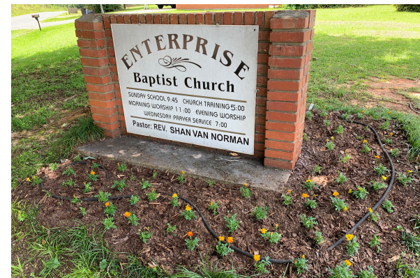
Fresh New Summer Flowers