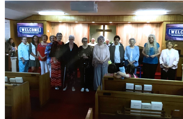
Mothers Day 2019