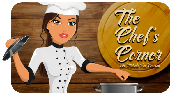
(This month's recipe provided by Sage Thompson)